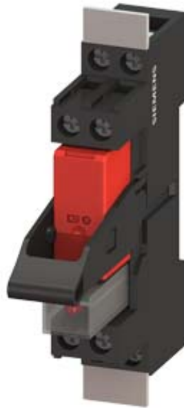
PLUG-IN RELAY COMPACT UNIT DC 24V, 2 CO CONTACT LED MODULE RED STANDARD PLUG-IN SOCKET SCREW TERMINAL