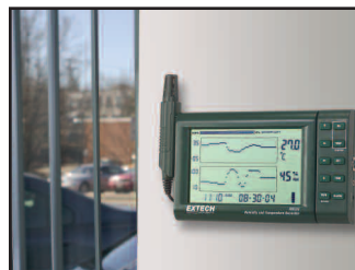
Wall mounted for storage and easy viewing of Temperature and Humidity trends with date/time stamp