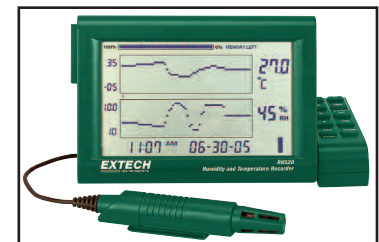
Desk mount configuration with easy to program swivel arm control panel plus probe with remote cable for reaching into ducts and humidity chambers