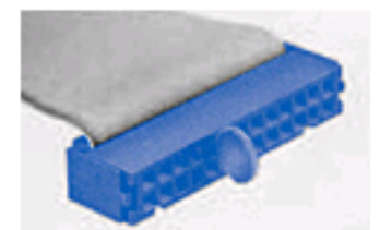
Plastic Key for Socket Connector