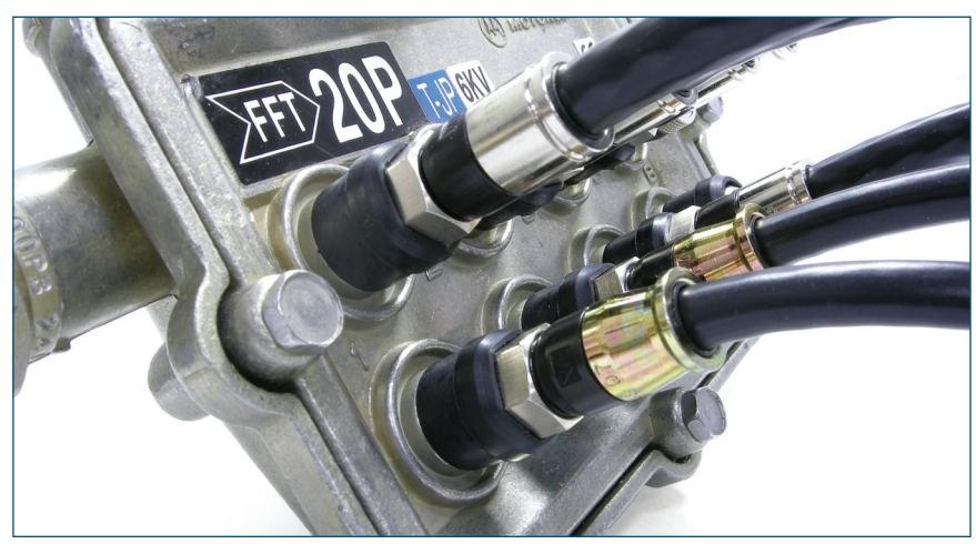
EX® Universal compression connectors used in combination with port seals ensure proper port sealing every time