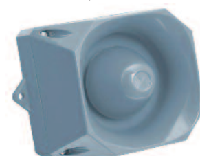
Asserta Midi Grey