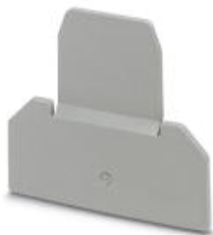
Partition plate, Length: 64 mm, Width: 2.5 mm, Height: 56 mm, Color: gray

Please be informed that the data shown in this PDF Document is generated from our Online Catalog. Please find the complete data in the user's documentation. Our General Terms of Use for Downloads are valid ( http://phoenixcontact.com/download )