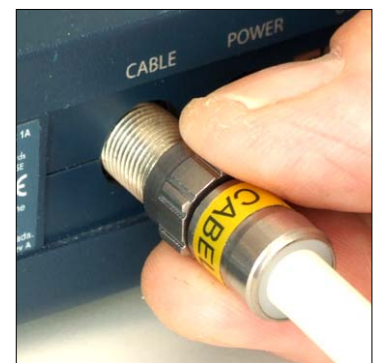
Self-Install™ with finger friendly nut

Use the Self-Install™ for CATV, satellite receivers, cable modems and other set-top box applications. The waterproof versions can be used for any outdoor application such as parabolic dishes etc.