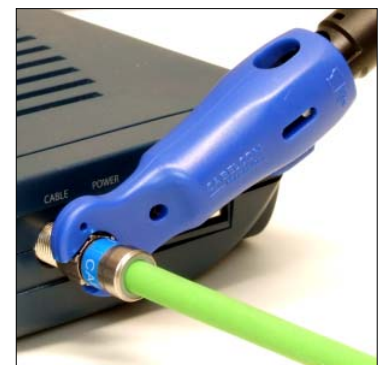
Proper tightening with the Pocket installer