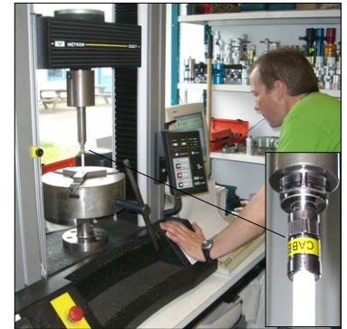
Computer controlled test of the pull strength

The waterproof Self-Install™ is equipped with two EPDM O-rings – one in the body part and one placed behind the nut to prevent moisture intrusion. However, to make sure that the connection is completely waterproof from the interface – we strongly recommend installing an external rubber sealing ring.