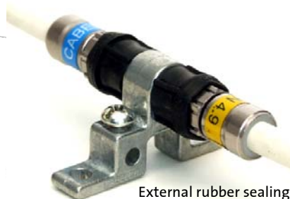
External rubber sealing mounted on Self-Install™

- is the perfect companion to go with a couple of Self-Install™ connectors for home installations. The pocket installer combines a RG6/59 cable stripper with mechanical stop for proper stripping length and an 11 mm spanner. The Pocket installer makes the cable preparation much easier and precise, while the spanner can be used for proper tightening.