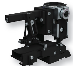
Pacific-Style SF Mechanical