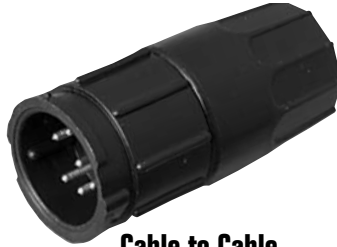
Cable to Cable 5X8X-XXB-XXX Matching Mates: • Cable Pin 3X8X-XPB-XXX • Cable Socket 3X8X-XSB-XXX