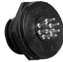
P/C Tail Panel Mount 4XXX-XXB-XXX Matching Mates: • Cable Pin 3X8X-XPB-XXX • Cable Socket 3X8X-XSB-XXX