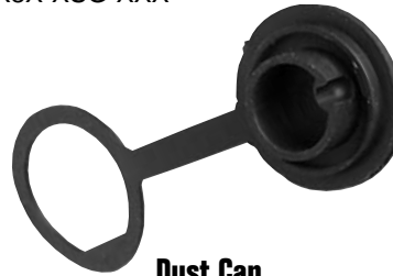
Dust Cap 4295