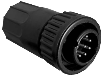
Cable Pin 3X8X-XPB-XXX Matching Mates: • Cable-Cable 5X8X-XSB-XXX • Panel 4XXX-XSB-XXX