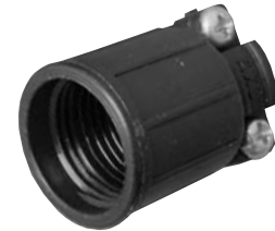
Mechanical Back Shell (Style #5)