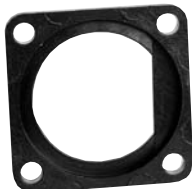
Square Flange Adapter 4296