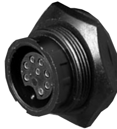
Panel Mount 4X8X-XXB-XXX Matching Mates: • Cable Pin 3X8X-XPB-XXX • Cable Socket 3X8X-XSB-XXX