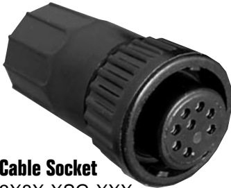
Cable Socket 3X8X-XSB-XXX Matching Mates: • Cable-Cable 5X8X-XPB-XXX • Panel 4XXX-XPB-XXX