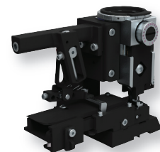
Pacific-Style SF Mechanical