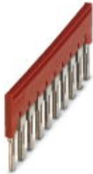
Plug-in bridge, Number of positions: 10, Color: red

Please be informed that the data shown in this PDF Document is generated from our Online Catalog. Please find the complete data in the user's documentation. Our General Terms of Use for Downloads are valid ( http://phoenixcontact.com/download )