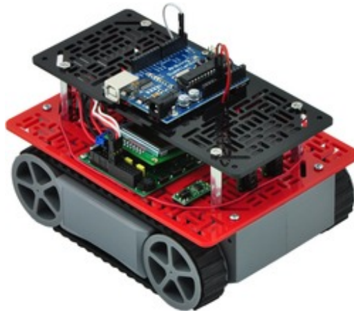
Two RP5/Rover 5 expansion plates with an Orangutan SV-328 and an Arduino Duemilanove.