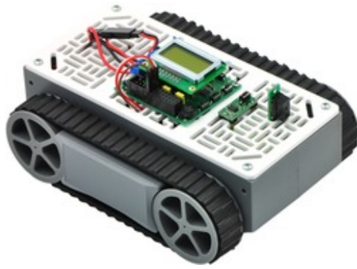
A narrow RP5/Rover 5 expansion plate with an Orangutan SV-328 and a Sharp digital distance sensor.