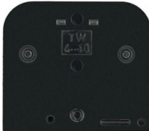
013010 TW für SAK 4

In order to do justice to the different requirements placed on our products, it is necessary to use various insulating materials tailored to the particular application. None of the insulating materials used by Weidmüller contain any hazardous substances. Above all, we ensure that all our materials are free from cadmium. Furthermore, they contain no colour pigments based on heavy metals and do not lead to the formation of dioxin/furan.