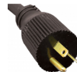
20A straight blade.