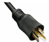
20A twist lock