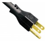
15A straight blade.

Four models each with a different plug type.