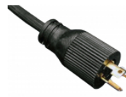
15A twist lock