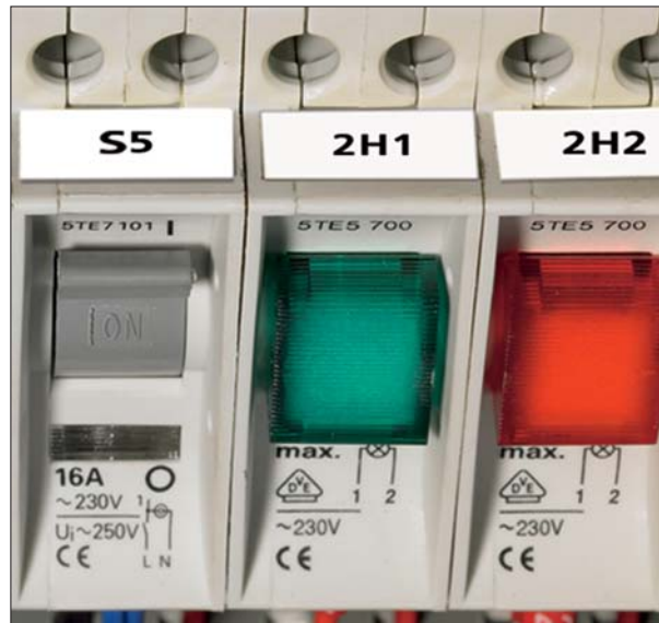
Helatag self laminating labels.

For problem-free printing, we recommend Tagprint Pro software.