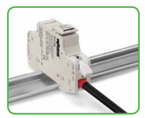
Ferruled Conductor up to 8 AWG, or twin ferrule up to 10 AWG