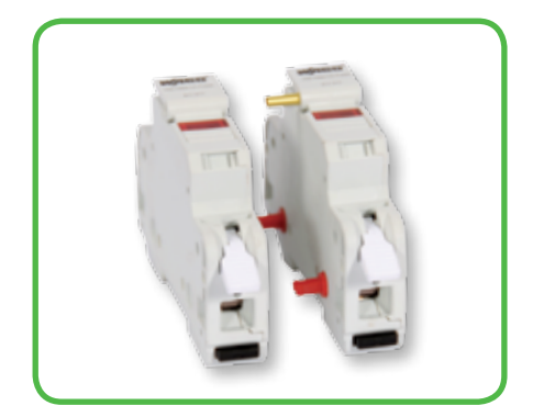
Coupling Kit used to create a 2- or 3-pole fuse holder