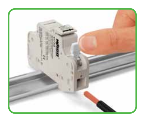
Conductor for Entry CAGE CLAMP® using lever actuation