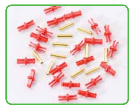
Coupling Kit allows multi-pole configuration