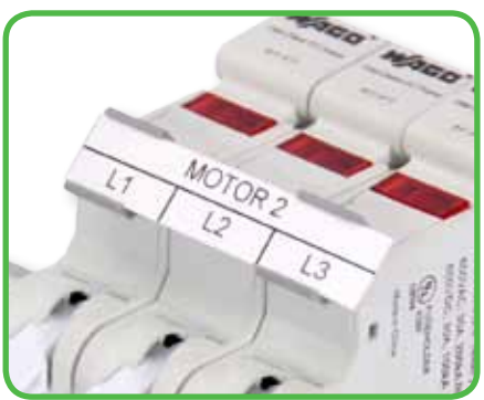
285-442 Marking Adapter allows the continuous marking strip to be used