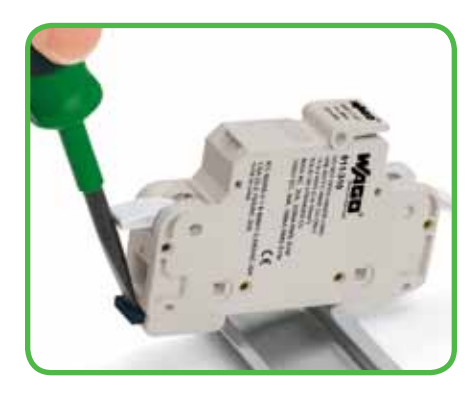
Mounting Clip for easy removal from DIN rail