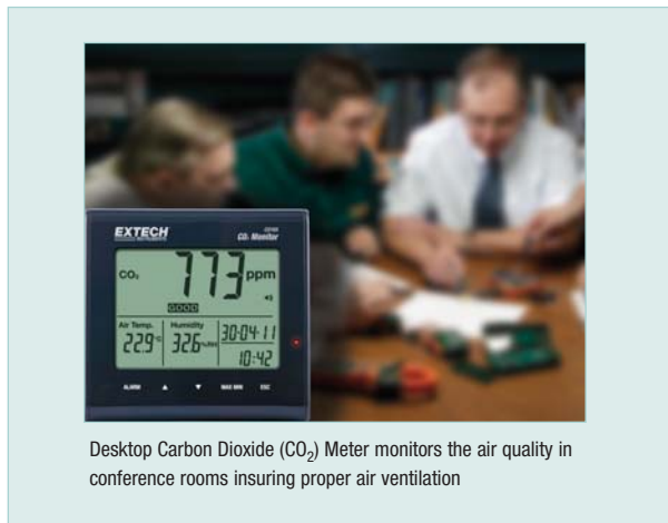
Desktop Carbon Dioxide (CO 2 ) Meter monitors the air quality in conference rooms insuring proper air ventilation