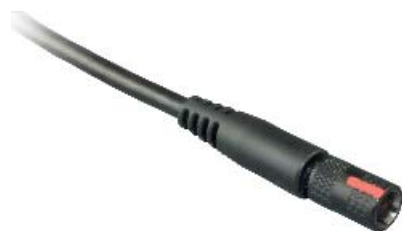
Series 804 Overmolded ASAP Cordset

Glenair's ASAP "Mighty Mouse" Overmolded Cordsets offer watertight sealing and excellent cold temperature flexibility. These cables are 100% tested and ready to use. Standard overmolded cables feature polyurethane jackets.