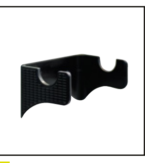
Wall Bracket (Included)

* Flashing mode specifications cannot be measured by ANSI FL1 standard. Flashing mode runtime is based on measurement of battery capacity change only.