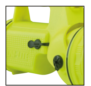
Side Charging Point