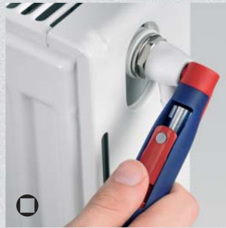
Square for air bleeding (Article No. 00 11 07 + 00 11 08)