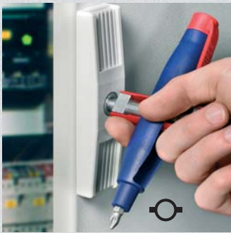
Opening a control cabinet with two-way key (Article No. 00 11 07)