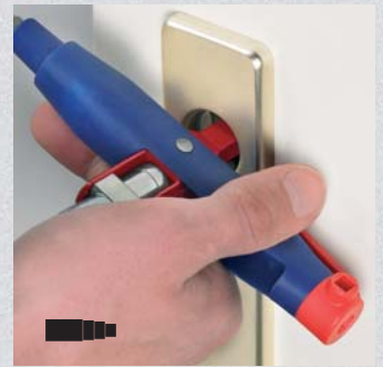
Square in steps for opening a door without handle (Article No. 00 11 08)