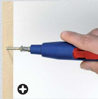
Tightening a screw with cross recess bit PH2 (Article No. 00 11 07 and 00 11 08)