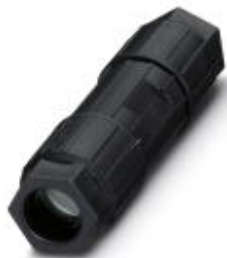
QUICKON conductor connector, 4-pos., connection cross section 0.34-0.75 mm 2

Please be informed that the data shown in this PDF Document is generated from our Online Catalog. Please find the complete data in the user's documentation. Our General Terms of Use for Downloads are valid ( http://phoenixcontact.com/download )