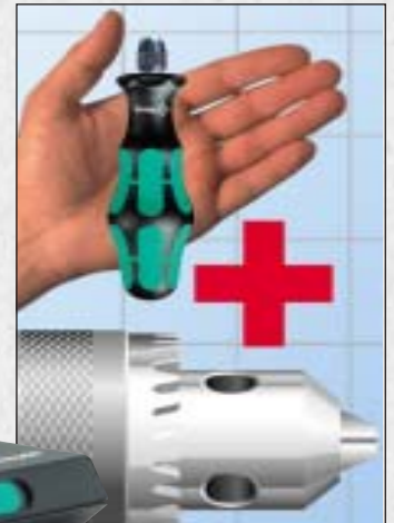
Kraftform Kompakt® - for both manual and machine operation.

Mobility and flexibility are the trend in our modern industrial world. Over 90 % of service technicians need tools for both manual and power screwdriving (rechargeable battery, electro or pneumatic screwdrivers) in their work.