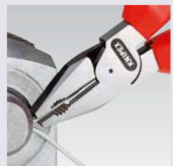
Powerful gripping, pulling and bending thanks to high leverage