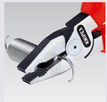
Induction hardened cutting edges also suitable for piano wire