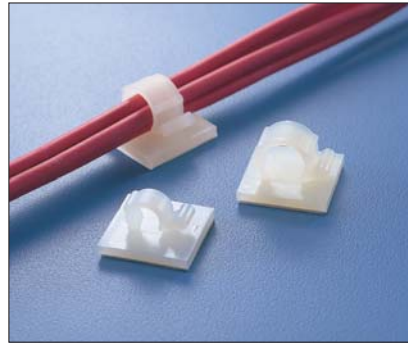
One piece fixing clips Type RA - quick and easy installation.

These clips are ideal for use in applications which are difficult to access, or for areas where a self adhesive is the only possible fixing method (for example where fixing 'holes' would be unacceptable).