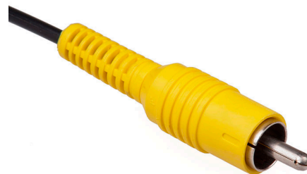
RCA composite video connector