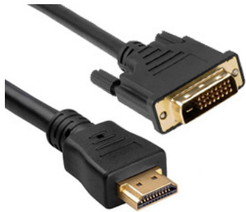
HDMI to DVI lead