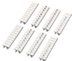
Zack marker strip, 10-section, horizontally labeled with the consecutive numbers: 41 ... 50, white, Width: 5 mm

Please be informed that the data shown in this PDF Document is generated from our Online Catalog. Please find the complete data in the user's documentation. Our General Terms of Use for Downloads are valid ( http://phoenixcontact.com/download )