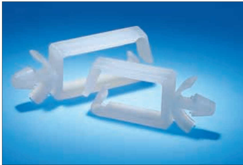
WPC – Wire Push In Clip.

With the increased complexity of electronic and electrical installations the use of the WPC clips enable cables to be installed using the minimum amount of space, a typical application would be in the frames/ rails of control cabinets.