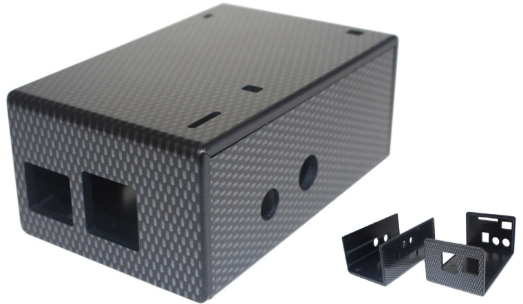
Raspberry Pi and Wolfson Audio Card assemblies not included