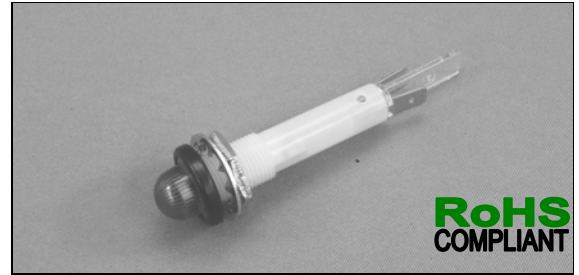
Recommended panel thickness: 0.030" to 0.250"