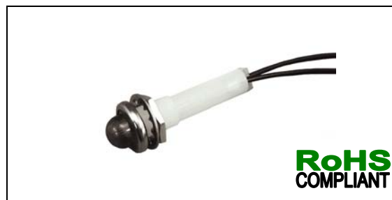
Recommended panel thickness: 0.030" to 0.250"