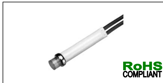
Minimum panel thickness: 0.030"