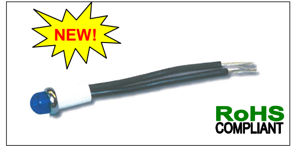
Minimum panel thickness: 0.030"

6" leads with 1/2" strip are standard Due to compact size, components (resistors, diodes) will be installed in the leads