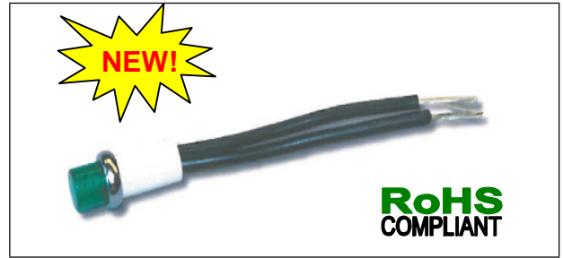
Minimum panel thickness: 0.030"

6" leads with 1/2" strip are standard Due to compact size, components (resistors, diodes) will be installed in the leads.