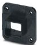
Panel mounting frames, Degree of protection: IP65/67, Material: Plastic

Panel mounting frames - CUC-V04-F-POBK-180 - 1407410