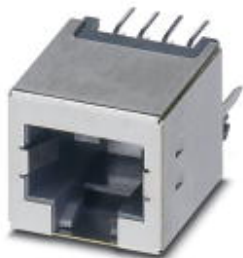
RJ45 socket insert, 1-way, for PCB mounting, CAT5e, 8-pos., shielded, with straight solder pins (THT)

Please be informed that the data shown in this PDF Document is generated from our Online Catalog. Please find the complete data in the user's documentation. Our General Terms of Use for Downloads are valid ( http://phoenixcontact.com/download )