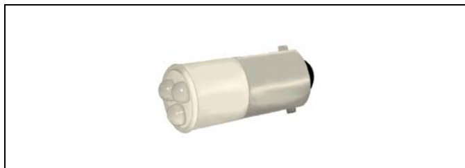
Lamp base in accordance to DIN EN 60061-1: BA9s

Electrical and optical data are measured at an ambient temperature of T_A = 25^\circ\text{C}