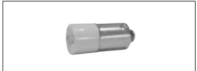
Lamp base in accordance to DIN EN 60061-1: BA9s

Electrical and optical data are measured at an ambient temperature of T_A = 25^\circ\text{C}