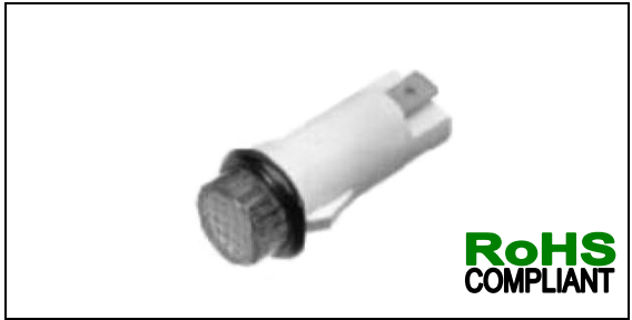
Recommended panel thickness: 0.030" to 0.090"