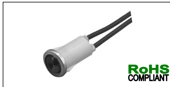
Recommended panel thickness: 0.030" to 0.090"