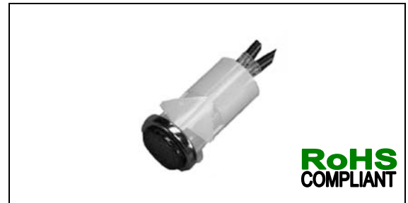
Recommended panel thickness: 0.030" to 0.090"