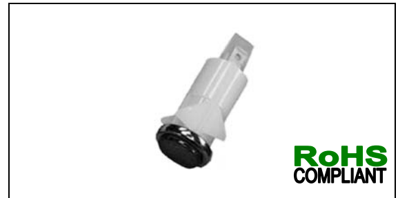
Recommended panel thickness: 0.030" to 0.090"