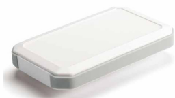
B= Black rubber corners