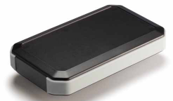
B= Black rubber corners