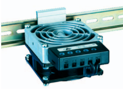
Shown: 100 W - HVL 031 Fan Heater