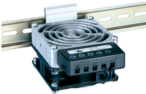
Shown: 100W - HVL 031 Fan Heater