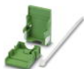
Cable housing, Pitch: 3.81 mm, Number of positions: 2, Dimension a: 10.01 mm, Color: green