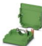
Cable housing, Pitch: 3.81 mm, Number of positions: 6, Dimension a: 25.25 mm, Color: green