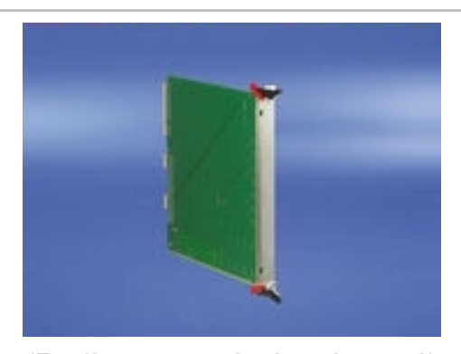
(Delivery excludes board)