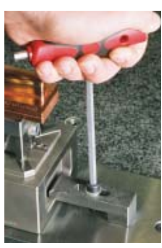
No screw can resist. The powerful Wiha ComfortGrip is quick and comfortable to use and even loosens screws that have been glued into position.

The hole in the handle can be used for shop storage.