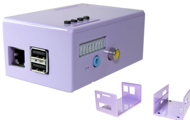
Raspberry Pi and PiFace™ Digital assemblies not included