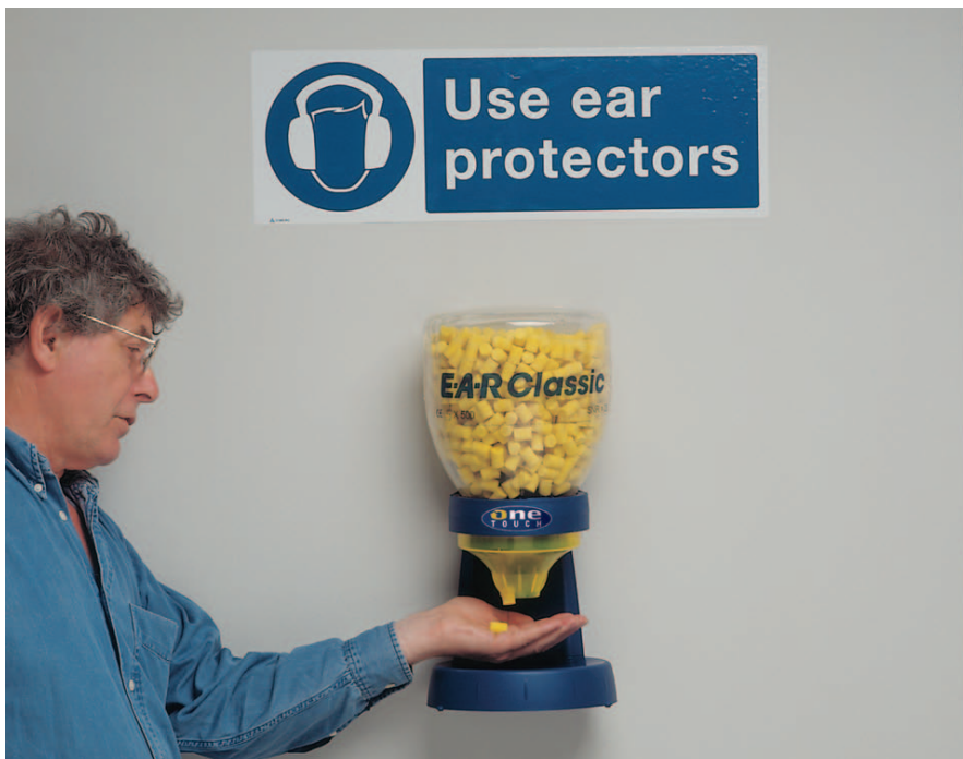
The E·A·R 'One Touch' can be wall mounted or free standing

Unobstructive access from front, or either side permits one hand operation by a clockwise or anticlockwise motion.