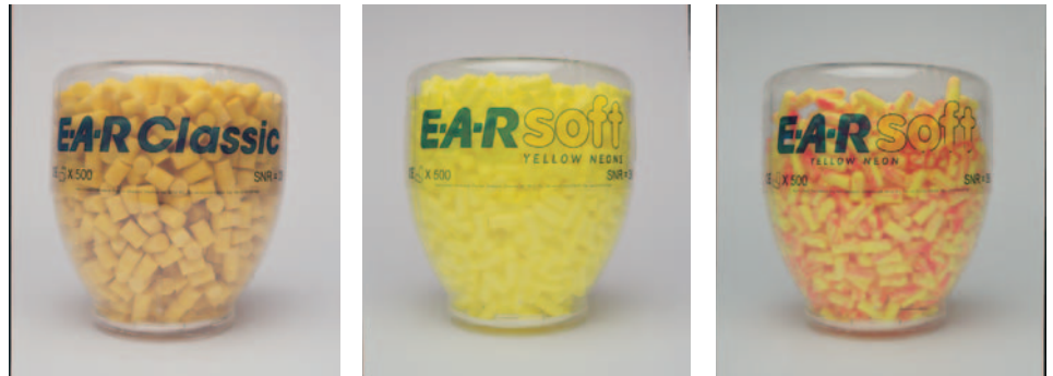
500 Pair Refill options for the One Touch

The 'One Touch' dispenser refills are extremely easy to change in a few simple steps (see diagrams 1-4 below). When the 'One Touch' is empty only the bottle needs replacing, the dispensing mechanism and stand can be used time and time again. Any residual plugs left can be emptied into the new refill resulting in no waste.