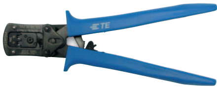
Crimping Tool, PN 6-1579014-8