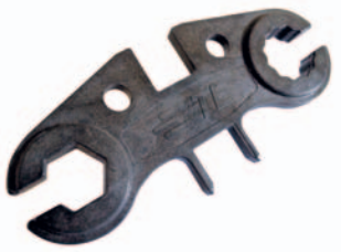
Field Tool - multiple functions, PN 1971903-1