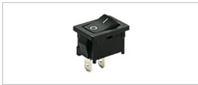
Similar to original product